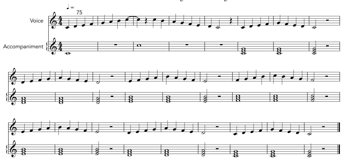
Exercise 2 - Rhythm Skills

Sing the following with the accompaniment using any suitable syllable or vowel sound. The starting note should be given.