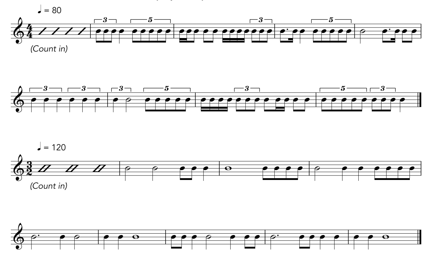
Exercise 3 - Singing A Cappella

This is an opportunity to showcase your singing skills in an a cappella or unaccompanied setting. You may choose to perform a section of a song and this may be from your recital choices, another piece of a similar standard or a song that you have composed yourself. Candidates are welcome to have a metronome/click and starting note immediately before the a cappella performance but after that the singing must be unaccompanied. For this section please sing between 1 and 2 minutes.